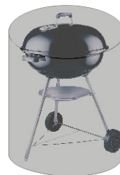
FITS ALL STANDARD SIZE KETTLE BRAAI'S