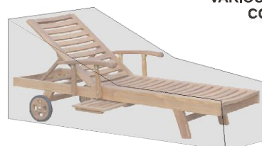
COVERS FOR SUN LOUNGERS AND DECK CHAIRS

WE CAN ALSO CUSTOM-SIZE ANY COVER FOR YOU