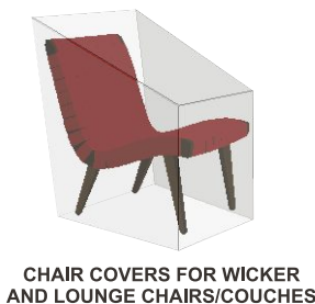
CHAIR COVERS FOR WICKER AND LOUNGE CHAIRS/COUCHES