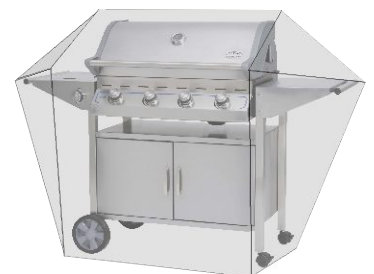
VARIOUS SIZES OF GAS BRAAI COVERS AVAILABLE